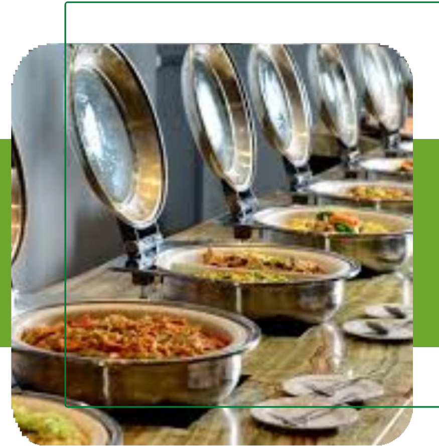
Catering & Food Services