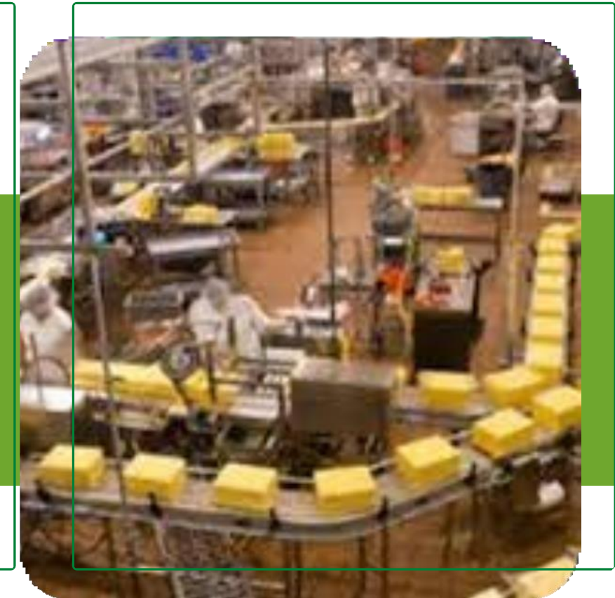
Machinery & Production Industries