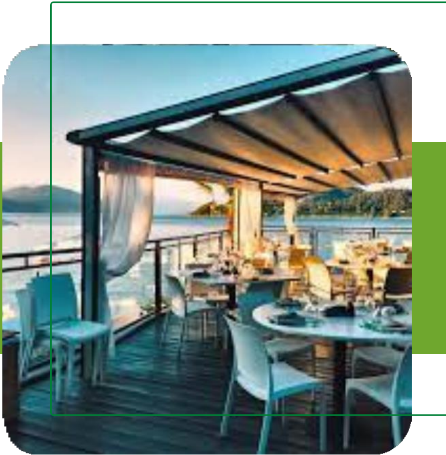
Hotels and Restaurants